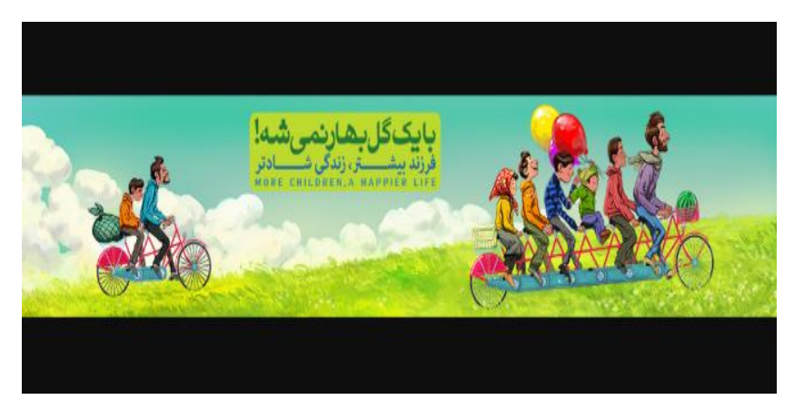
Fig. 13. Family and Children