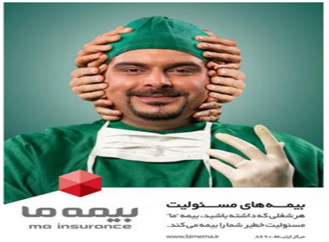
Fig. 8. Insurance and Jobs (1)