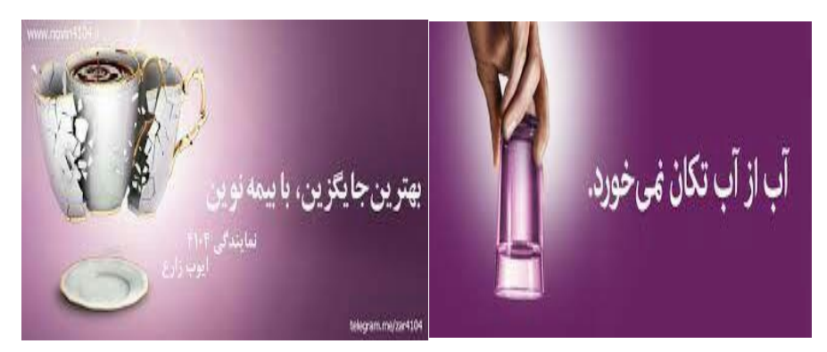
Fig. 16. Insurance and Compensation (1)