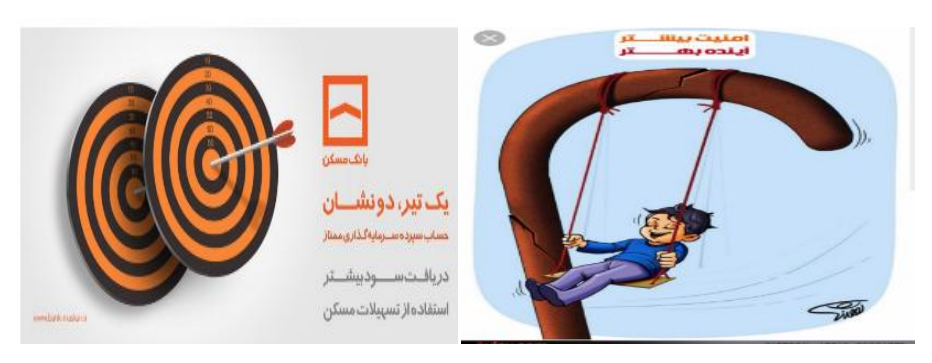
Fig. 1. Banking System