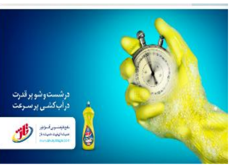
Fig. 6. Detergents and Washing Speed