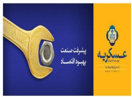
Fig. 4. Banks and Industry