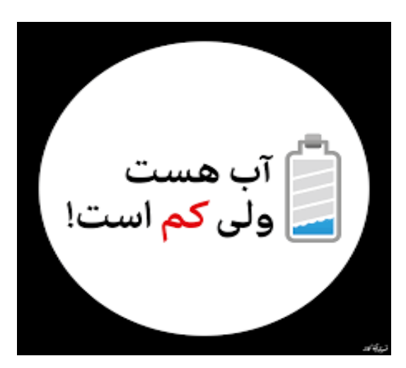
Fig. 20. Loss of Water