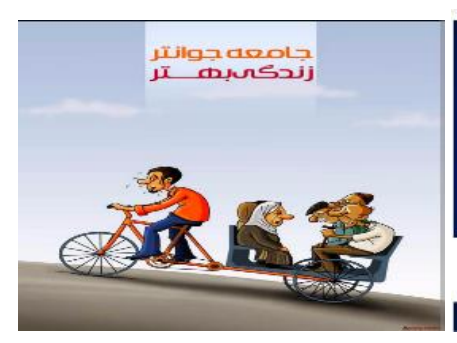
Fig. 5. Family and Generation