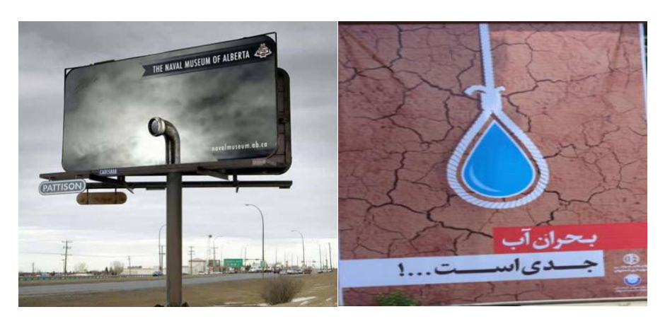
Fig. 18. Exhibition