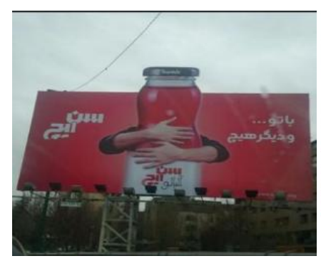
Fig. 7. Demonstration of Love