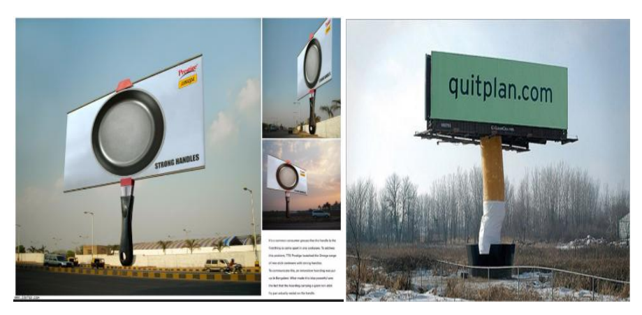
Fig. 14. Advertisements of Home Appliances